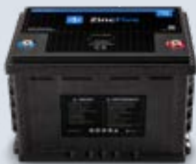
80 Ah High-Rate

Powerful, recyclable, non-flammable, and compact, ZincFive's nickel-zinc monobloc batteries are optimal for a variety of stationary and industrial applications, including backup, grid operations support, and EV charger power buffering.