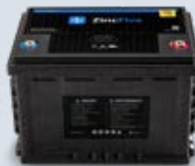
90 Ah Ultra-High-Rate